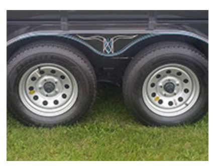
Trailer may be shown with optional equipment. Specifications subject to change without notice.