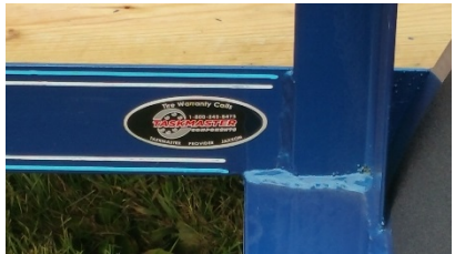
Trailer may be shown with optional equipment.