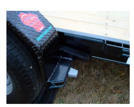
Trailer may be shown with optional equipment. Specifications subject to change without notice.