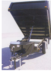
Heavy Duty Hydraulic System