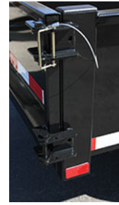
Bolted Tailgate Hinge & Holdback Pins