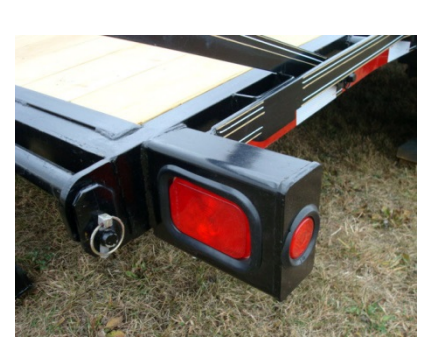
Trailer may be shown with optional equipment.