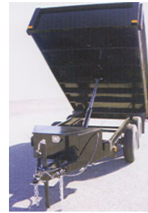
Heavy duty hydraulic system