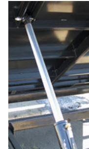
3" hydraulic cylinder

Trailer may be shown with optional equipment. Specifications subject to change without notice.