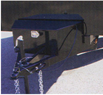
Hydraulic system in lockable box