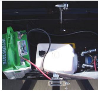
12 volt hydraulic pump