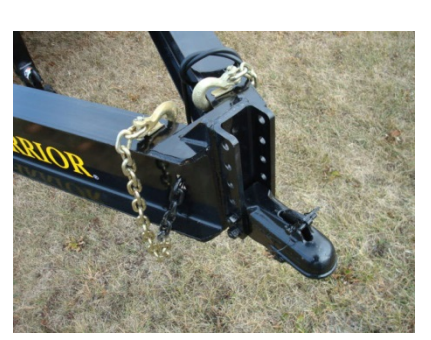
Trailer may be shown with optional equipment.