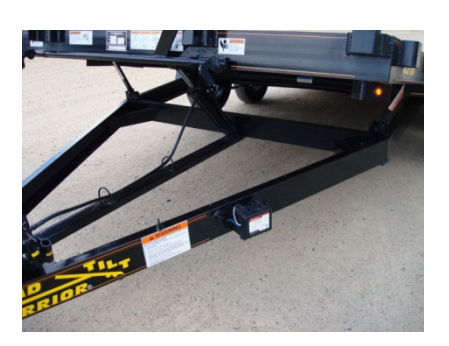
Trailer may be shown with optional equipment. Specifications subject to change without notice.